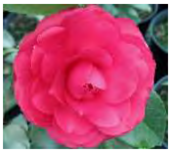
C. Japonica 'Middle Georgia'