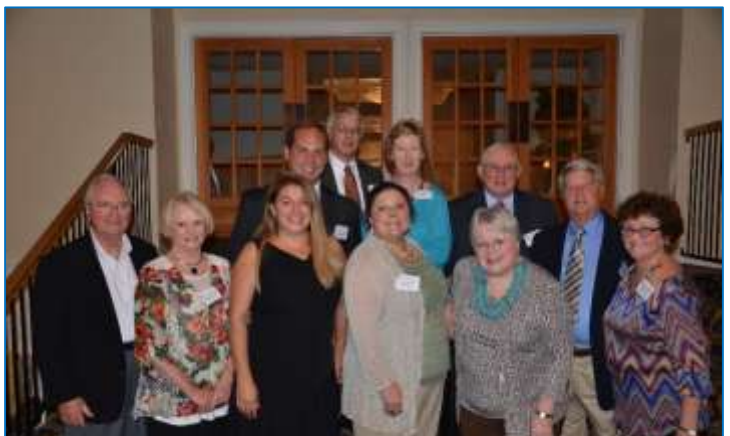
The MGCS delegation attending the ACCS Convention